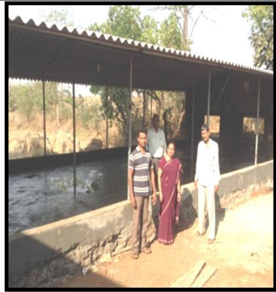
Poultry Shed Construction Work